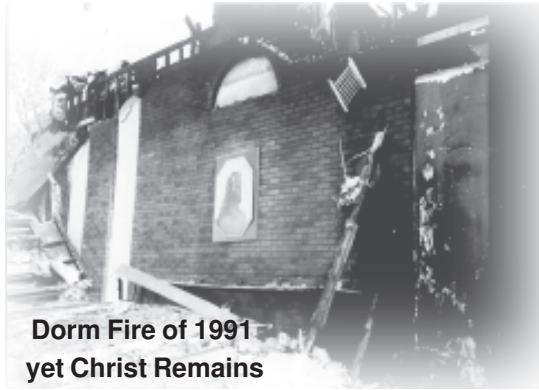
Dorm Fire of 1991 yet Christ Remains

An electrical fire on July 25, 1991 completely destroyed the dormitory. A recent housing expansion has increased our capacity to do this great work and although at the time of this writing it does not exist, we believe very soon we will be rescuing and discipling women in their greatest hour of need.