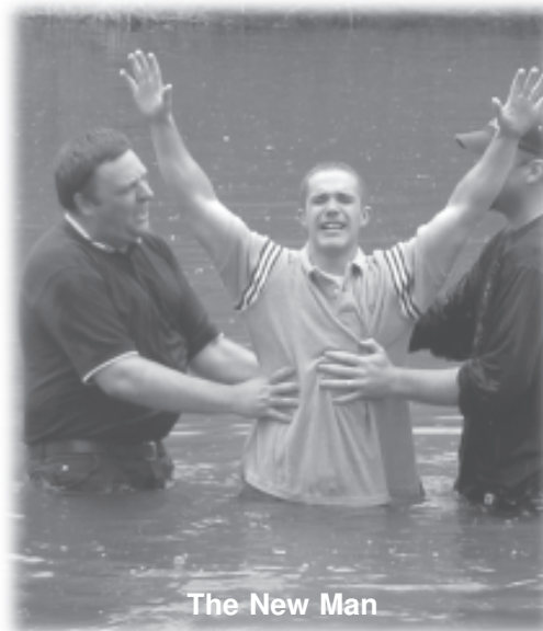
The New Man