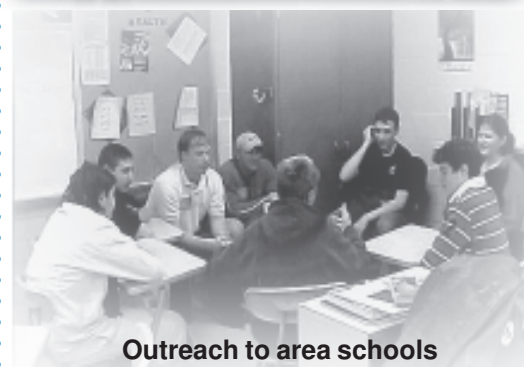
Outreach to area schools