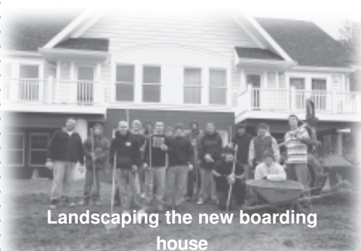
Landscaping the new boarding house