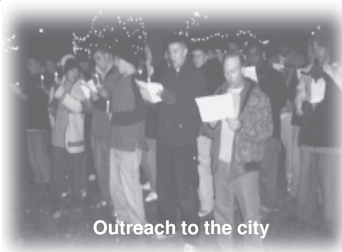
Outreach to the city