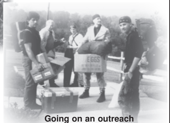
Going on an outreach