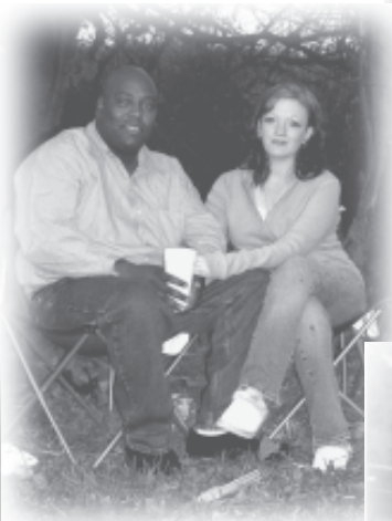
Restoration of relationships