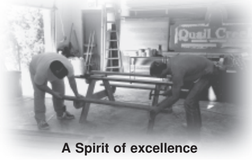
A Spirit of excellence